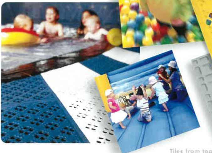
Tiles from top: Play Matta™ Kidz™ open surface, Play Matta™ Kidz™ Smooth Top and Play Matta™ Kidz™ closed surface