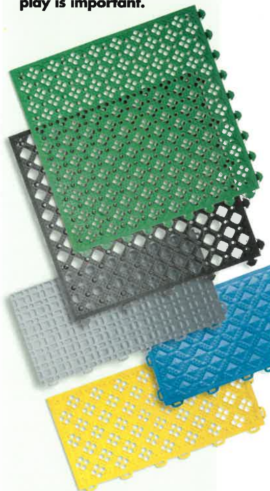
The Play MATTAs™ 'Family', pictured from top: Play MATTAs™ Original; Play MATTAs™ Safety™; Play MATTAs™ Kidz™ Smooth Top, closed surface and open surface.

Layout of colours and floor area can be changed around and, if not secured, can be rolled up for cleaning or storage.