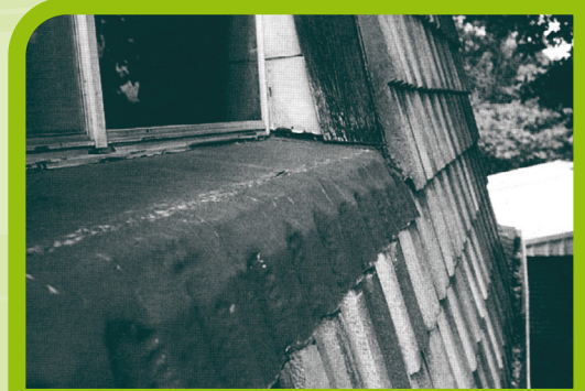
Weathered asbestos roofing

We recommend that you use a WorkSafe New Zealand licensed asbestos removalist to remove asbestos-containing material if there is wire, cladding, paint or plastic covering the asbestos-containing material as the process or removal is likely to be difficult. Incorrect removal is likely to release asbestos fibres, which are a risk to health.